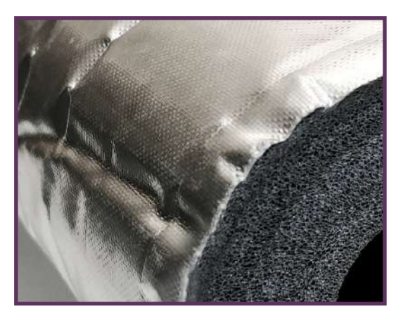
Puncture resistant multilayer aluminium foil