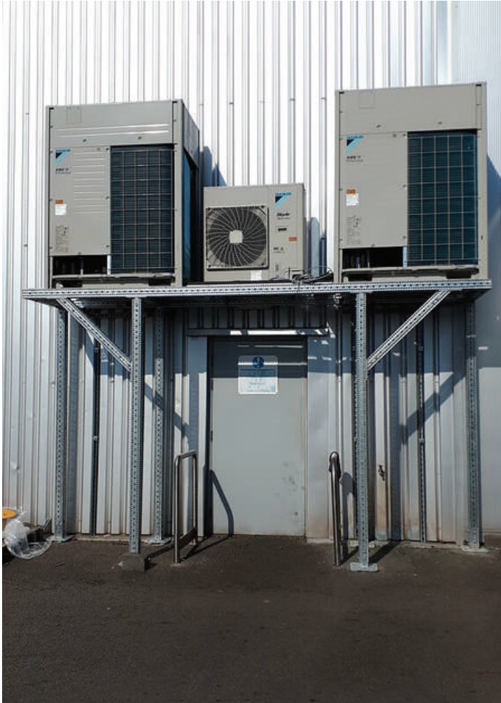
Non-welded modular steelwork

Framo is a multi-functional, non-welded support system for the modular construction of framing solutions. This amazing product simply screws together, eliminating the need of drilling, bolting and welding, effectively preventing onsite delays through its pregalvanised finish.