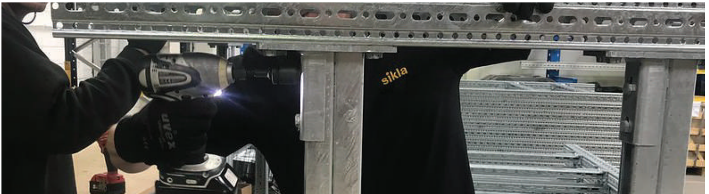
One thread forming screw for all component connections