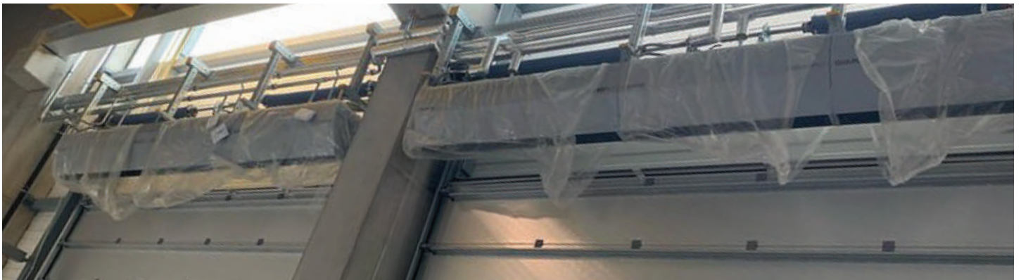
Frame and module assembly modifications can be made quickly on site with no loss of time cut-outs or re-works