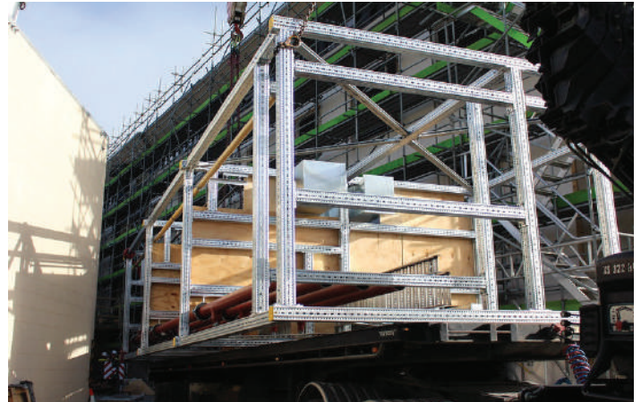
Easy to assemble and disassemble