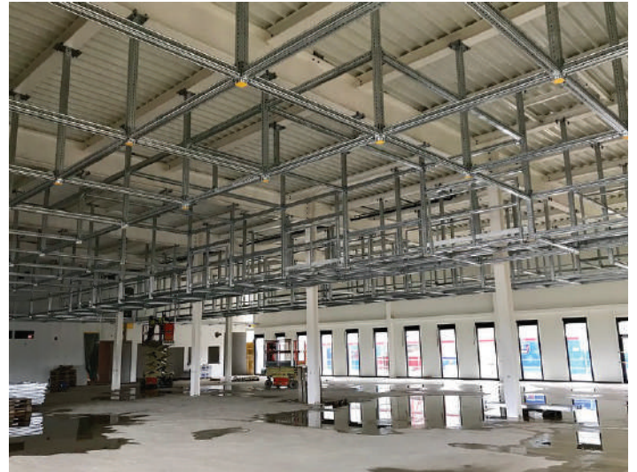
Maximum flexibility minimum installation time