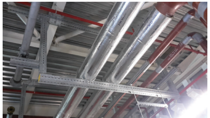
Higher performance lower weight of steel