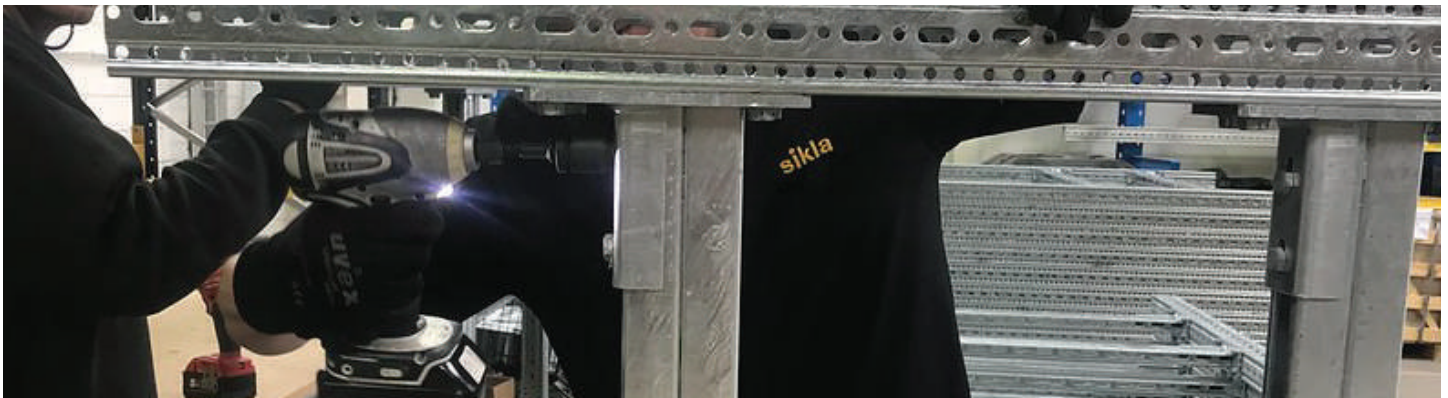
One thread forming screw for all component connections