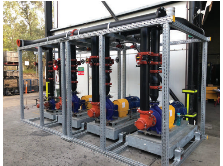
Frame and module assembly modifications can be made quickly on site with no loss of time cut-outs or re-works