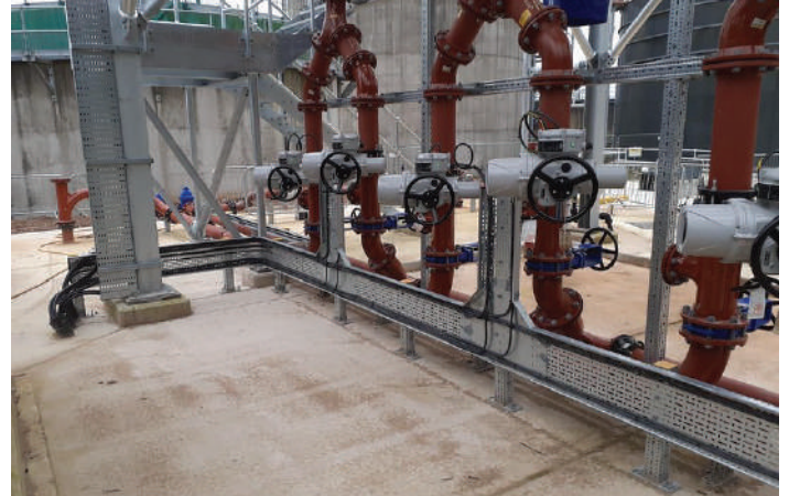
Compatible with other installation systems