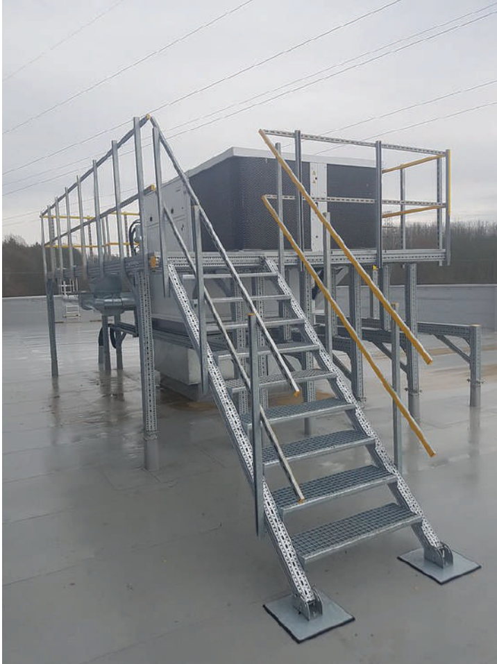
Easy to assemble and disassemble

Lightweight, robust and incredibly versatile, this innovative system is designed to provide high torsional resistance, allowing for durable structural support framework in the construction, mining and process industries. In addition to its time and cost efficient capabilities, it is up to 80% lighter when aligned with comparable traditional steelwork profiles, making it the perfect solution for heavy duty support applications.