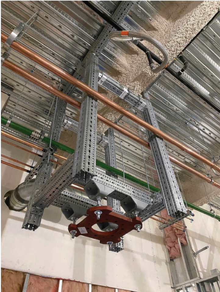
Non-welded modular steelwork

Framo is a multi-functional, non-welded support system for the modular construction of framing solutions. This amazing product simply screws together, eliminating the need of drilling, bolting and welding, effectively preventing onsite delays through its pregalvanised finish.