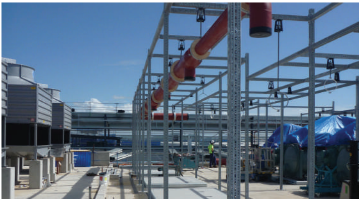
End-2-end solution design, plan, install and ready to use!