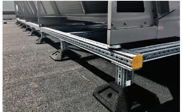
High corrosion resistance as standard