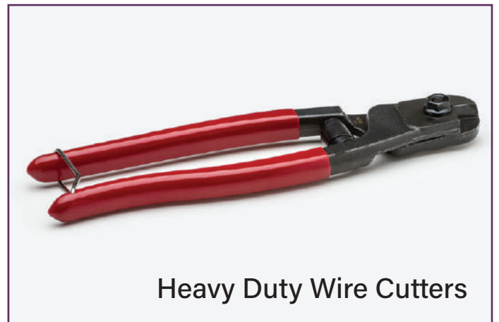
Heavy Duty Wire Cutters